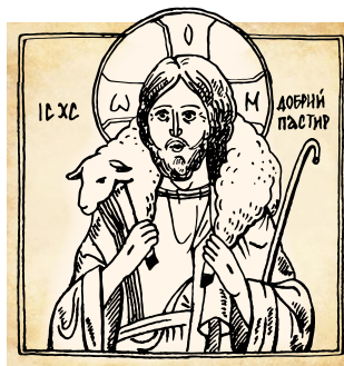
Ninth Day: Saturday Gospel of John 21:15–25

3. Beyond the parish. Let us look if among my neighbors there isn't some individual or family that is in dire need. Let us try to help this person, these persons, with a kind word, with some concrete assistance.